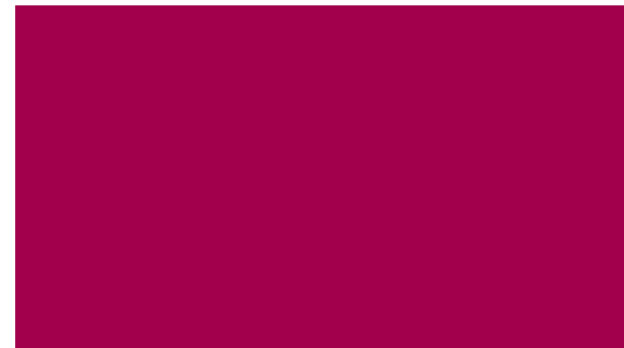
TABLE VII. Cleaners and Primers

Some cleaning techniques may give better results than others; determine the best technique for your application. For especially difficult-to-bond-to surfaces, it may be necessary to increase the surface reactivity by using chemical etchants or oxidizers or by exposing the surface to UV, corona, plasma or flame sources. Allow solvents to completely evaporate before applying the primer.