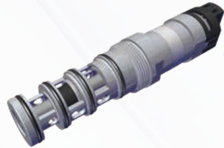
Low Noise Option BV